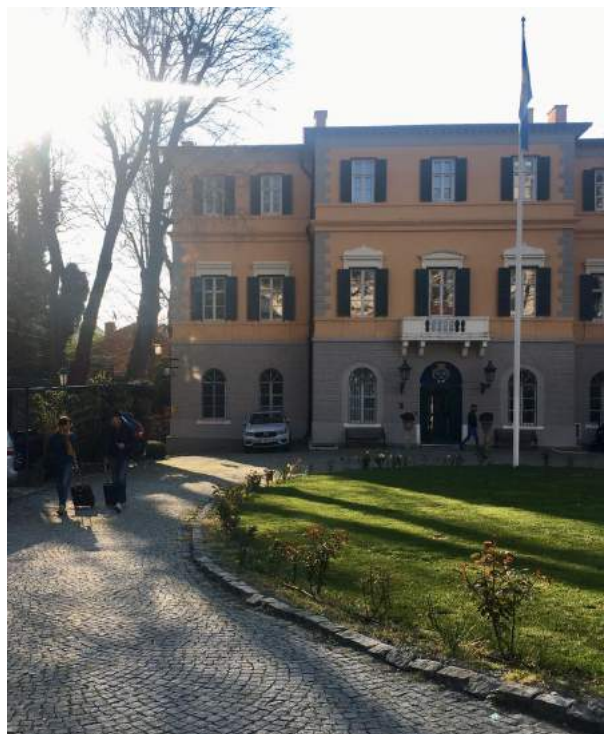
Leaving Istanbul, March 18, 2020.

We felt very confused at first: what do you do with a research institute when you cannot receive fellows and organize events? But after a lot of thinking and long discussions, we are now getting back on our feet. We have organized two workshops by Zoom, one of translation and multilingualism in May, another on the Byzantine romances in June, and our very first Dialoglar event in collaboration with the cultural section at the Consulate General. At the latter, some